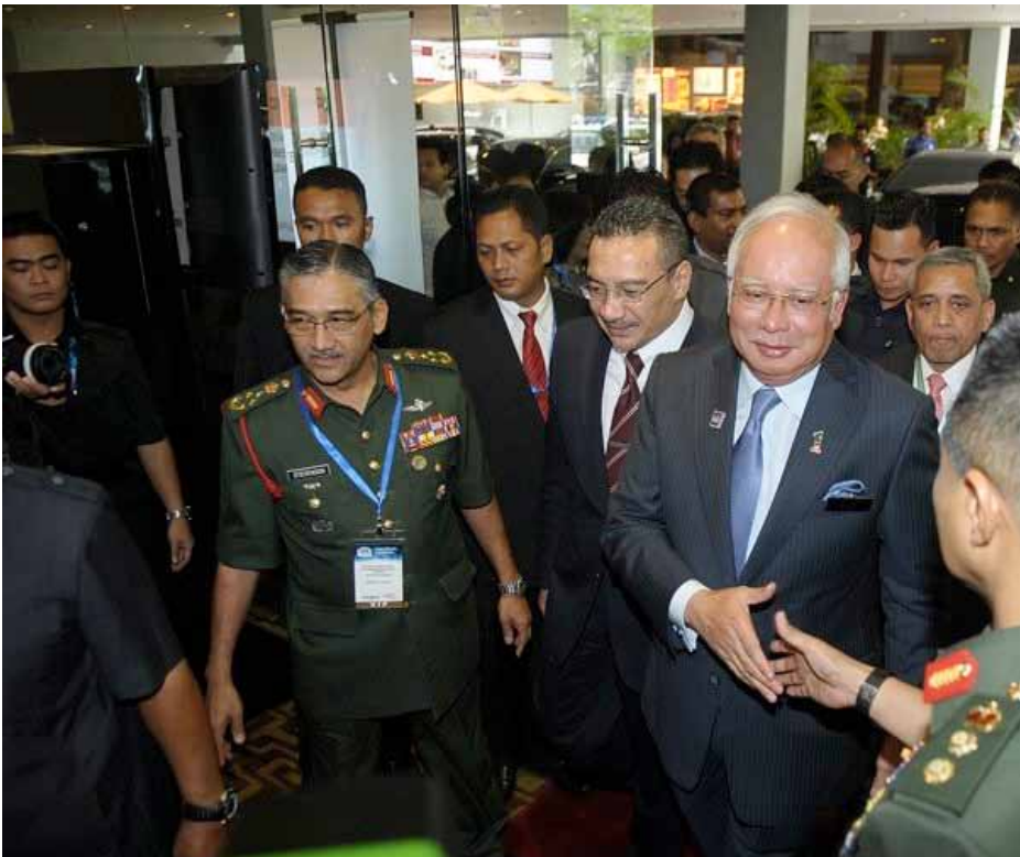
The arrival of the Right Honourable, Dato' Sri Mohd. Najib Tun Razak, Prime Minister of Malaysia accompanied by Minister of Defence, Secretary General of the Ministry of Defence and Chief Executive of MiDAS.

The Putrajaya Forum 2014 with the theme 'Strengthening Security and Regional Stability' was successfully organised by MiDAS at Seri Pacific Hotel, Kuala Lumpur on 14-15 April 2014. It is an international platform for policy makers, defence and security agencies, think tanks, as well as academicians to meet, discuss and share knowledge to promote understanding on regional and international defence and security issues through two keynote addresses and six plenary sessions that addressed current events and future challenges to national, regional and global security. This 3rd Putrajaya Forum 2014 has helped to enhance know-how and knowledge amongst the forum participants in understanding and dealing with global, regional, trans- national and national security and defence issues that threaten common ideals, way of life and survival. Clearly the six sessions helped provide new perspectives, experiences and invaluable input from international, regional and national policy makers, academicians, and defence and enforcement agencies that face the same issues in their daily business.