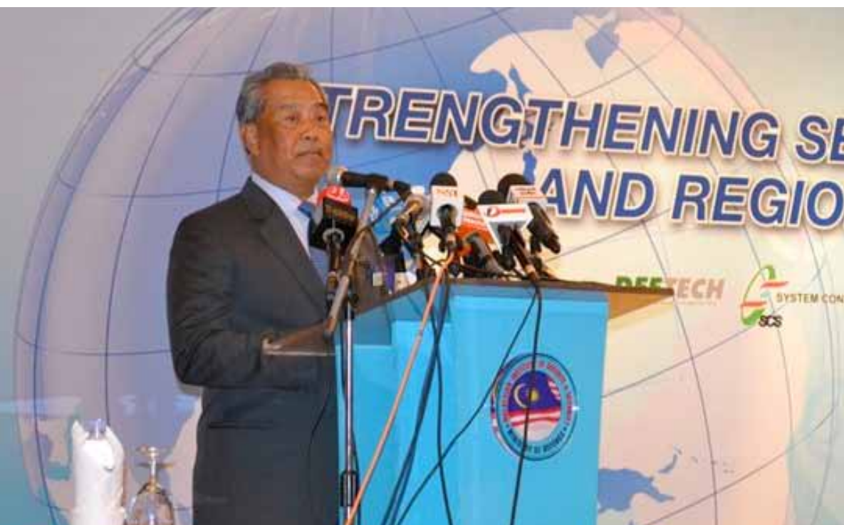
The Right Hon. Tan Sri Muhyiddin Hj. Yassin, Deputy Prime Minister of Malaysia delivering his 'Closing Address' amidst distinguished international and local guests at the Putrajaya Forum 2014

The Right Honourable Tan Sri Muhyiddin Hj. Yassin, Deputy Prime Minister of Malaysia praised all the guests and participants at the closing ceremony of Putrajaya Forum 2014. After the opening salutations, he thanked the Malaysian Institute of Defence and Security (MiDAS), the organisers of the 3 rd Putrajaya Forum for giving him the opportunity to deliver once again the closing address of the prestigious forum. Looking at the main theme of "Strengthening Security and Regional Stability", he had no doubts that the forum this year had managed to engage equally, a variety of experts and academicians to address the importance of not only strengthening the regional security but maintaining the stability which Asia was currently enjoying. He expressed his pleasure to be in the presence of local and international distinguished speakers and moderators as well as all participants.