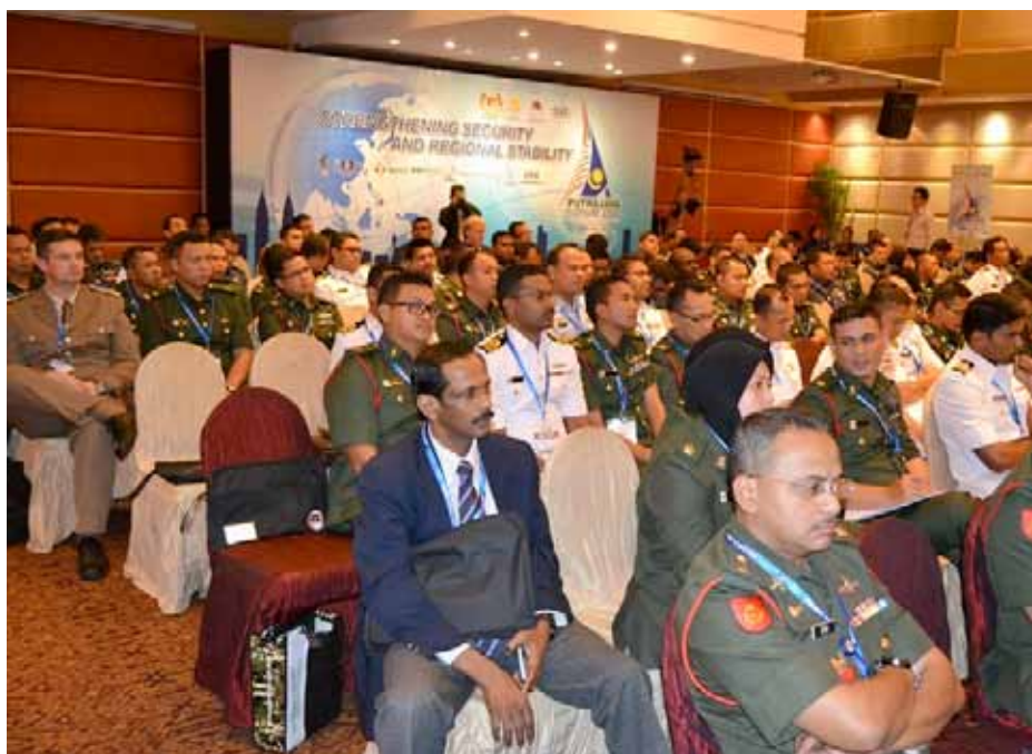
Participants of Keynote Address 2

He said that there were many lessons that could be gained from this incident and certainly one that was most prominent was the threat from non-state actors and in a non-traditional manner. Another vital factor was the close cooperation with our ASEAN neighbours, in this case, Philippines where information and certain security cooperation prevailed at the height of the crisis was vital. The incident shows that the biggest threats to nations today are not always from each other. Instead it may come from shadowy groups, often with historical grievances. These groups recognize no national boundaries and whose motivations are often unclear or shifting. Previously, many Asian countries might have thought of itself not as major targets for large-scale terrorism by religious extremists in the way that the West may be. Yet Asia's experiences with global terrorism were every bit as tragic as those of the United States, United Kingdom or Spain. From Bali to Colombo, what was traditionally termed the East or even the Islamic world, are as much locked in this battle as their Western counterparts.