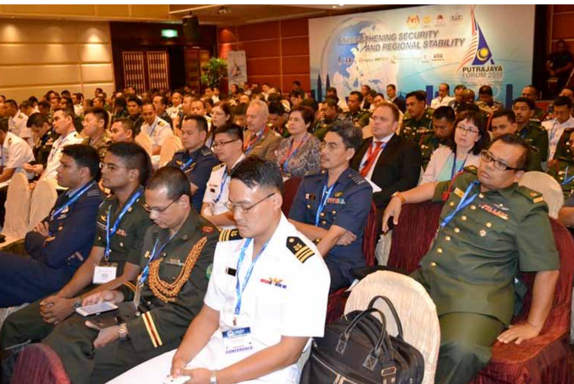
Participants of Session 6