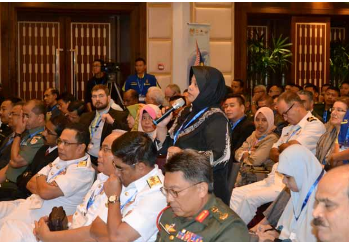
A participant posing a question

He explained that this can partly be explained by the fact by the different policy approaches taken by each of them. IOM's response to this humanitarian crisis within Kosovo focused on community stabilization activities. These activities addressed the root causes of tension and displacement by providing for basic needs beyond emergency relief. In short, displacement was reduced and return encouraged by making the place of origin more attractive economically and socially, thus creating a pull factor. IOM also assisted Kosovo's neighbours cope with the strains of large numbers of arrivals of Kosovar Albanians through temporary evacuation to safety in third countries, medical care and medical evacuation, the provision of public information, and training and capacity building for the Governments in dealing with vulnerable migrant populations. IOM also provided services in camp management, community relations and micro-enterprise activities.