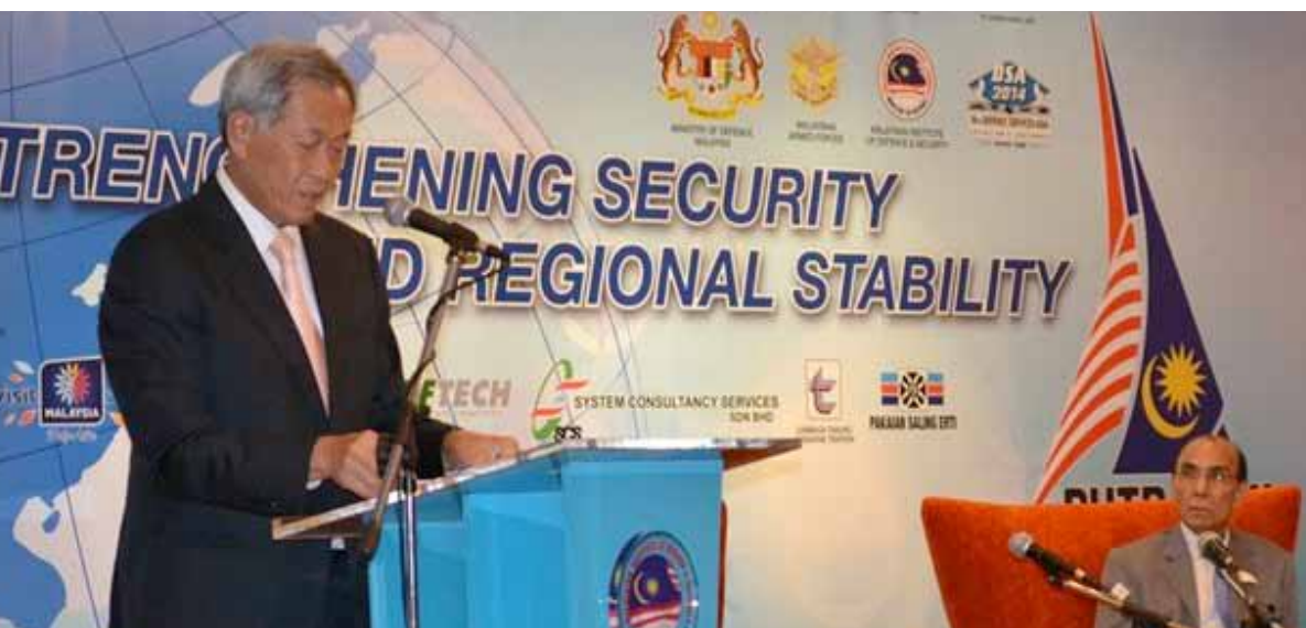
The Honourable Dr. Ng Eng Hen, Minister of Defence Singapore as speaker for Keynote Address 1

The Honourable Dr. Ng Eng Hen, Minister of Defence Singapore began by explaining that bilateral defence ties between Malaysia and Singapore were growing stronger in tandem with their overall state relationship. Political leaders on both sides recognise that they have many shared interest for a better future together. Both governments are actively looking for ways to enhance bilateral cooperation, build confidence and trust with each other and provide mutual benefits for their citizens. Many people would acknowledge the progress made, and many good ideas, including the high speed rail link which is currently under serious study as to how it may be implemented soon.