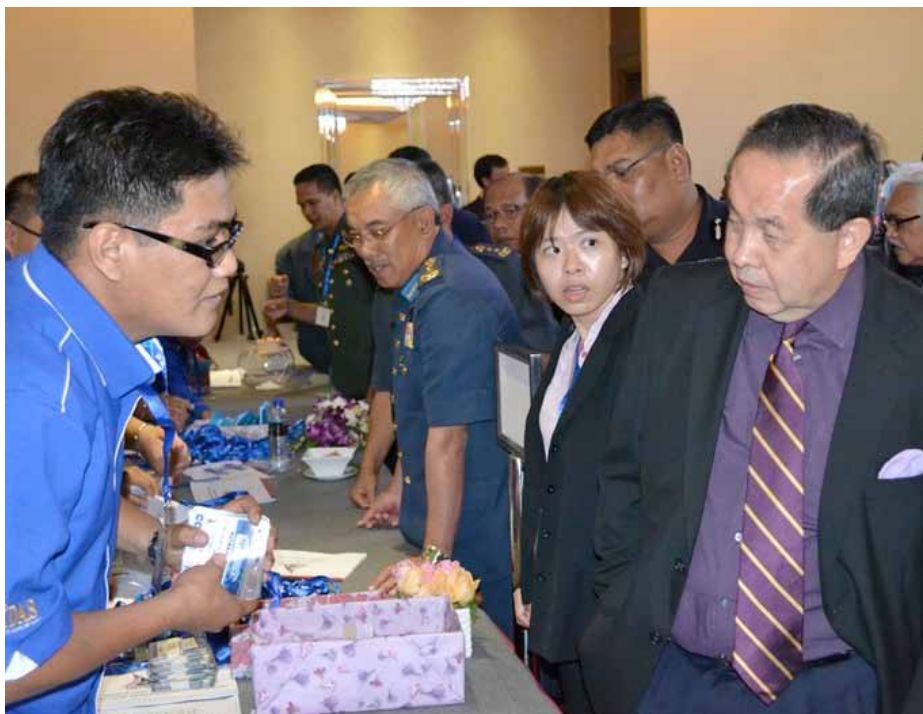
Putrajaya Forum 2014 guests and participants registration

had. He believed that the shared interests amounted to a better future together for citizens. Both Defence Ministers he added had a goal of deepening bilateral defence relations by pushing up existing military interaction across the three services. He admitted that in this day and age no wars are expected between states but he was assured that a Human Disaster Relief (HADR) situation was a must and was foreseeable for any career soldiers' future as the trend was rising each year. He identified scale of a disaster, the existing mutual trust between militaries and the increased greyness or lack of demarcation of what amounted to the traditional and non traditional security threats.