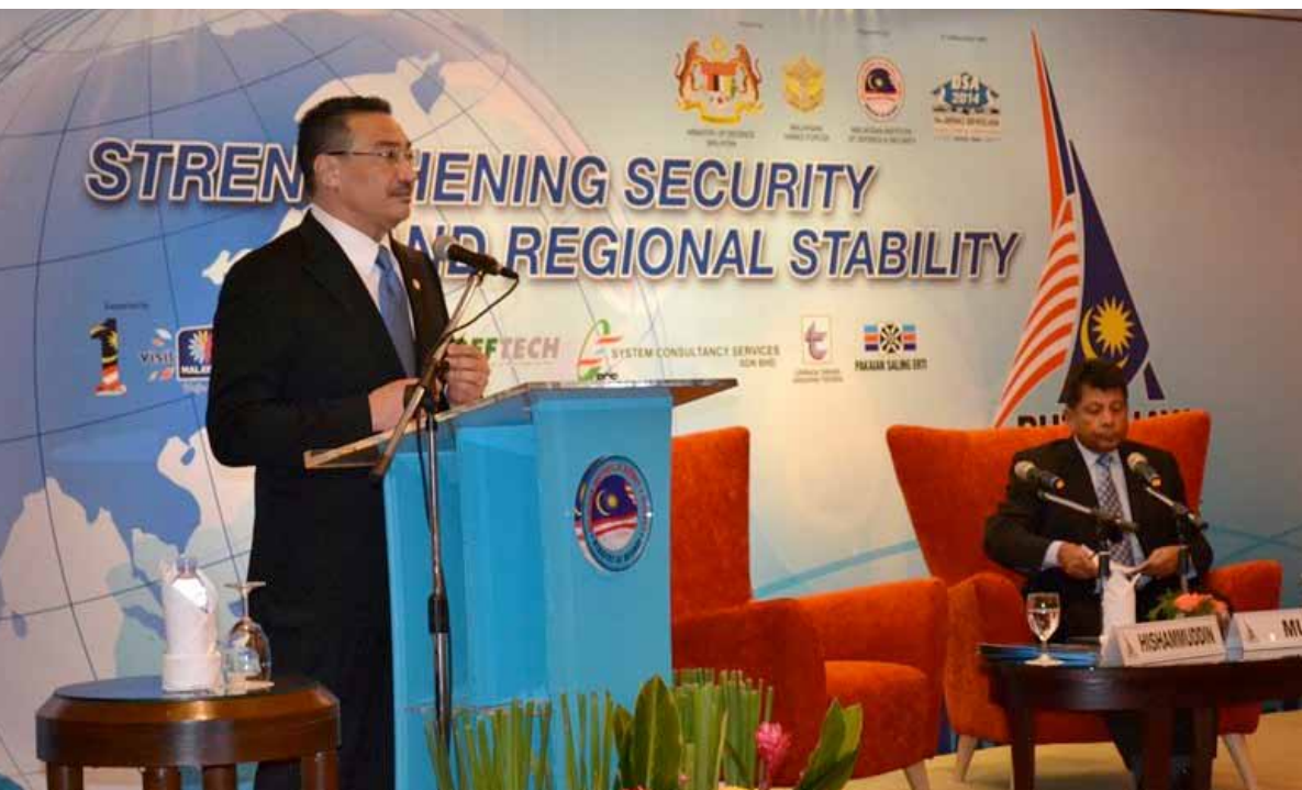
Honourable Dato' Seri Hishammuddin Tun Hussein, Minister of Defence Malaysia as Keynote Address 2 speaker of the Putrajaya Forum 2014

The Honourable Dato' Seri Hishammuddin Tun Hussein, Defence Minister of Malaysia was the speaker of Keynote Address 2. He expressed his joy by having the privilege to deliver the Keynote Address 2 on the 'Emerging Regional Security Threats' at the Putrajaya Forum 2014, the third in its series, which was organised by the Malaysian Institute of Defence and Security (MiDAS). Although he punned that many may consider the topic mundane but it was a topic that all stakeholders both those in and out the region should be concerned with. There was rapid economic growth and prosperity all around the region and as such it was pointless for us as governments to continue the valiant effort without including the security ambit of the growth in order to secure the region further without hiccups.