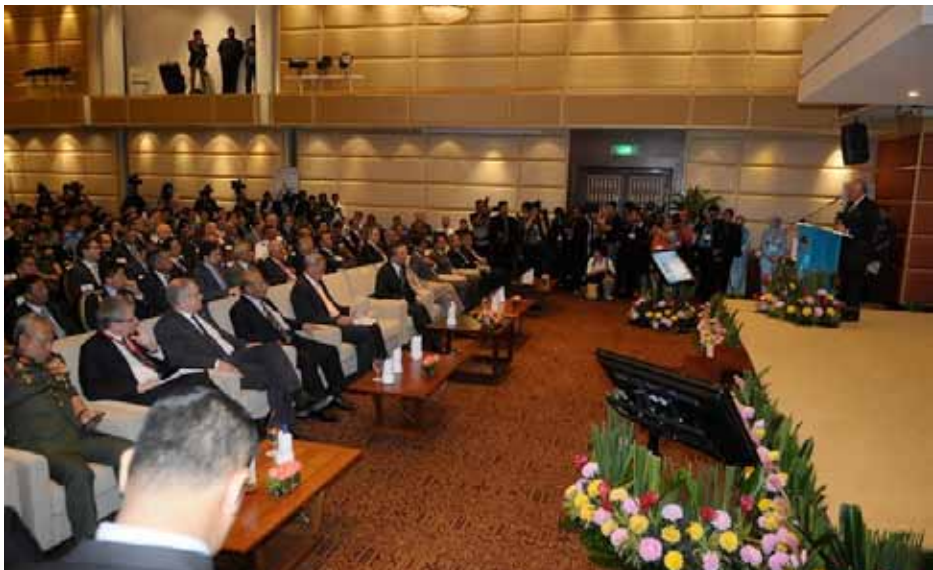
The Right Honourable Dato' Sri Najib Tun Razak, Prime Minister of Malaysia delivering his 'Opening Address' amidst distinguished international and local guests at the Putrajaya Forum 2014

The Prime Minister said that ASEAN could also play a strong role in promoting a culture of peace. Conflicts within ASEAN members, be it due to ethnic drive or political differences continued to be a cause of concern. Malaysia would continue to play a facilitative role in addressing this internal conflict whenever such a request was made. He was heartened that moderation had been adopted as a key of ASEAN values. The challenge was to turn the concept into specific actions. Organisations such as the Global Movement of Moderates should continue to work closely with existing ASEAN institutions such as ASEAN Institute for Peace and Reconciliation. Programs related to moderation should be included in the road map to establish the ASEAN community which was to be adopted in Malaysia in 2015.