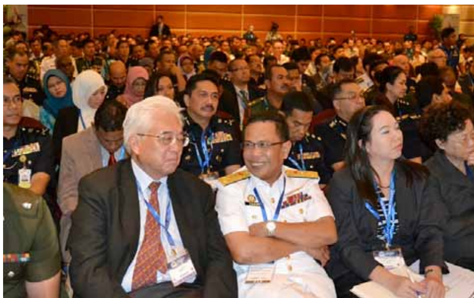
Civilian and Uniformed participants of Session 1