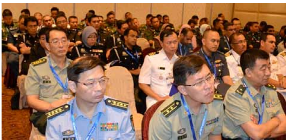
Guests and participants for Session 4

He highlighted that in today's world, there are many subjects with not enough experiences or details available for analysis and interpretation on doctrine. He mentioned that the bases or data on which we have based on doctrine for nuclear war fighting and deterrent for that matter. During the Cold War, there were doctrines for fighting tactical nuclear wars as well as full scale nuclear wars.