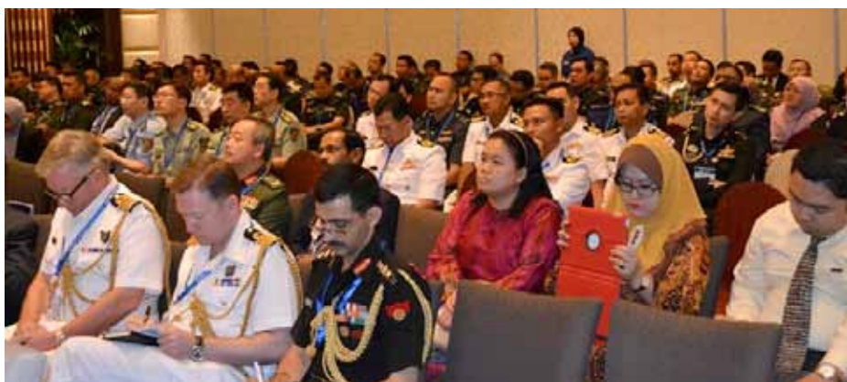
Guests and participants for Session 4

He highlighted two important facades of document development and its use. The first point is that doctrine can stagnate and become irrelevant if the assumption and condition created either changed or they are not updated. The difference between doctrines and principles of wars is the needs to trust the ability of their generals employing doctrine to have the good judgments of knowing in what way we can depart from the laid down doctrine.