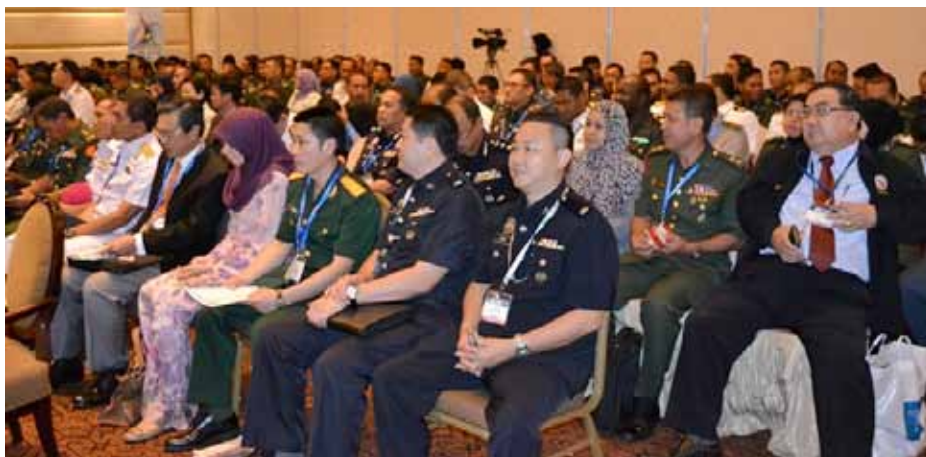
Participants of Session 2

He added that operationally, the UK's priority is a stronger collective domestic and international response to money laundering. For the UK, that means a focus on professional enablers including legal professionals, accounting professional and trust and company service providers who often facilitate money laundering through negligence or outright complicity. He pointed out that one of the main barriers to tackling money laundering is the fact that criminals hide their money overseas. The Mutual Legal Assistance process is often slow, so it is important to improve international intelligence and evidential exchange. Wherever possible, the UK will seek asset sharing agreements so that both the UK and its overseas partners share a percentage of the confiscated illicit assets.