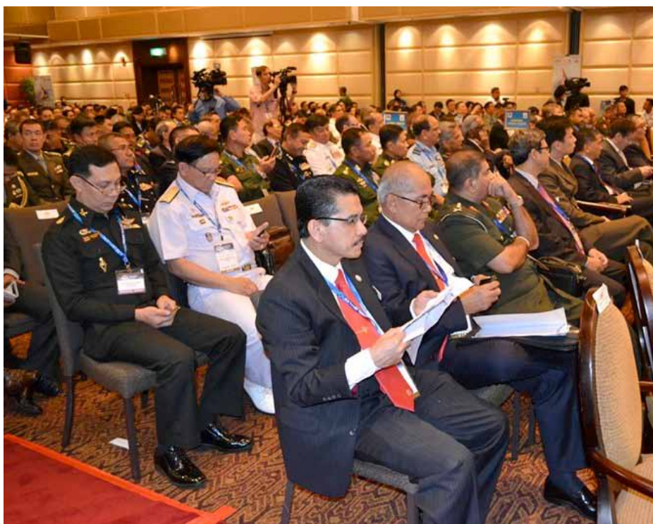
Distinguished guests of the Putrajaya Forum 2014