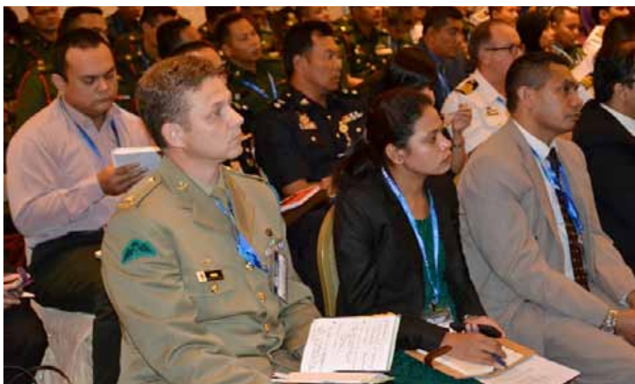
Participants of Session 5