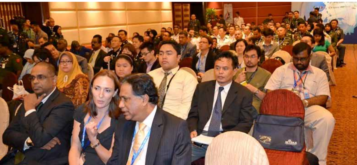
Participants of Keynote Address 2

In short, cyber attacks are a daily reality and are growing in sophistication and complexity. Thus keeping pace with this evolving threat requires evolving solutions. Today, humanity seems to be vulnerable to threats and devastation, if not from man-made threat, it is from Mother Nature. He was referring to Environment Security. It was recently reported that by the middle of 21st century significant disruption to human society and the natural world is expected unless action is taken to address environmental degradation. The current phenomenon of global warming has caused some environmental degradation and it has directly affected the wellbeing and survivability of the human race. Climate change is believed to pose new challenges to states and directly shapes national security policies. Presently, nations are often called upon to assist in Humanitarian Assistance and Disaster Relief (HADR) efforts. Internal Disaster, External Disaster, Trans-Boundary Disaster, Natural Disaster, Endemic and Pandemic have continued to challenge human resolve.