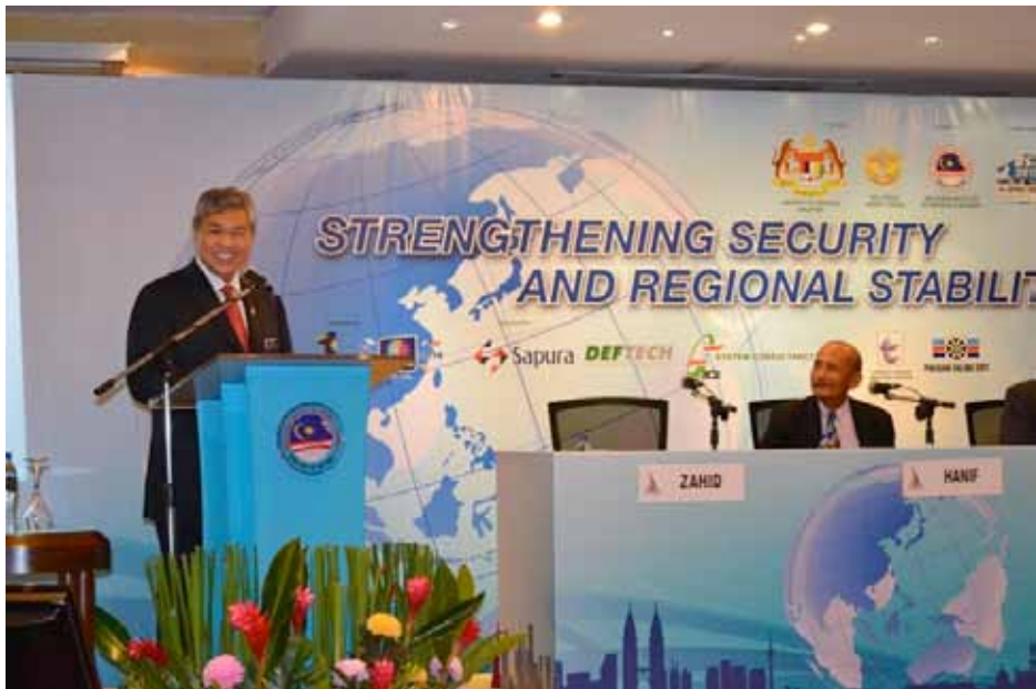
The Honourable Dato' Seri Dr. Ahmad Zahid Hamidi Minister of Home Affairs Malaysia as the first speaker of Session 1

He summarized that Malaysia is currently a State Party to 9 out of 13 International Conventions and Protocols relating to terrorism. Malaysia is a signatory to all three International Drug Control Conventions. He continued that Malaysia has in place, several tough legislations to curb serious offences in transnational crime which include: Prevention of Crime Act (Amendment & Extension - POCA) 2013, Security Offence Special Measure Act (SOSMA) 2012, Anti-Trafficking in Persons and Anti-Smuggling of Migrants Act (ATIPSOM) 2007, Dangerous Drug Act (DDA) 1952, Anti Money Laundering Act & Anti Terrorism Financing (AMLATFA) 2001, Communications and Multimedia Act (CMA) 1998. The latest initiatives undertaken by the Ministry of Home Affairs include setting up STING – Special Tactical Intelligence Narcotics Group and STAFOC – Special Task Force Organized Crime. Lastly, he concluded that Malaysia is looking into transnational organized justice by introducing and amending POCA.