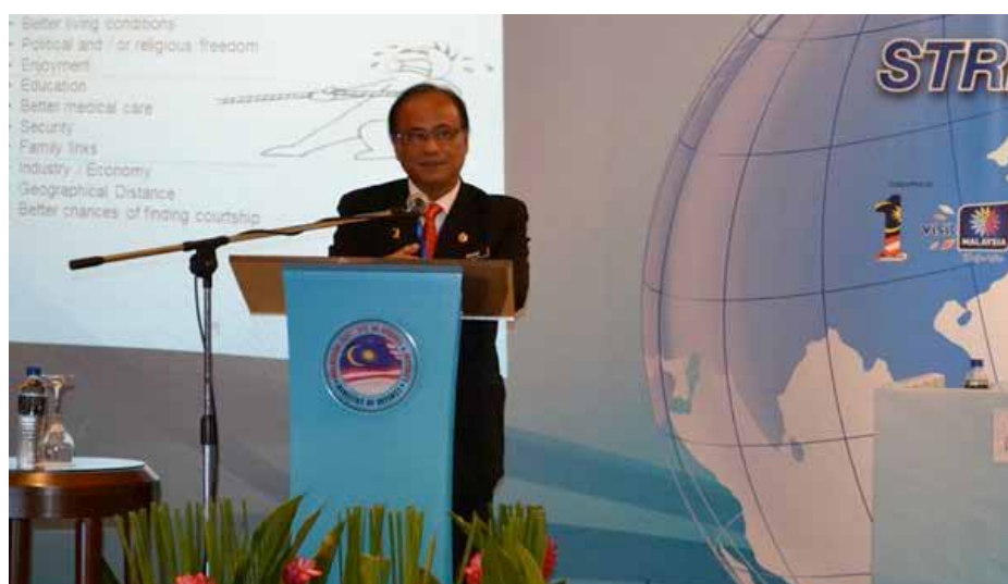
Dato' Sakib Kusmi Deputy DG Immigration Department of Malaysia as first speaker for Session 3

immigration in their colonies. Looking back as early as 1970's and 1980's, where the majority of the newly industrializing countries in SEA particularly Singapore, Malaysia and also Thailand had adopted an export-oriented industrialization strategy to promote their economic development had resulted in the shortage of domestic labour. In association with the global distribution and relocation of manufacturing production and at the same time for the purpose of monitoring and control the flow of movement of the migrants, these states also developed strategies and measures that included the establishment of necessary legal frameworks for economic migrants.