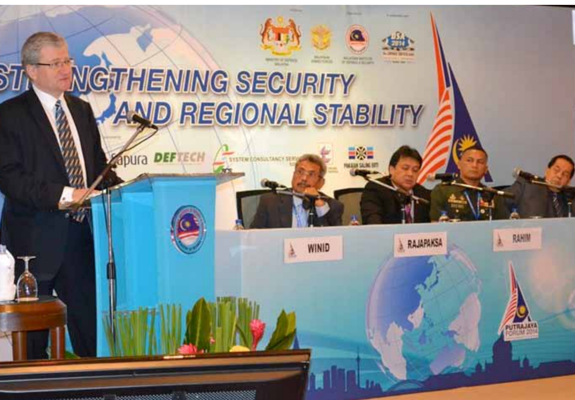
HE Mr. Boguslaw Winid, Undersecretary of State for Security Policy / Deputy Foreign Minister, Poland as the first speaker for Session 6

HE Mr. Boguslaw Winid, Undersecretary of State for Security Policy/Deputy Foreign Minister, Poland was the first speaker for Session 6. He began with pleasantries to the government of Malaysia, the organisers and participants. He was happy to speak and had found the invitation an honour as it would allow him to present to the forum a Polish point of view on this challenging issue everyone was facing. He added that it was fortunate that the topic today was very relevant and current. He added that the modern warfare angle now was more a confrontation between states and non states actors of different proponents. In fact he joked that in the