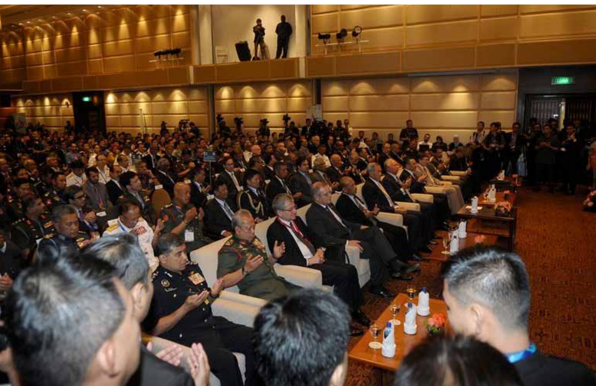
'Opening Ceremony' of Putrajaya Forum 2014

The Right Honourable Dato' Sri Najib bin Tun Razak, Prime Minister of Malaysia welcomed all the participants to the Putrajaya Forum 2014 on behalf of the government of Malaysia. He recalled the first forum back in 2010 which focused on the emergence of regional security architecture. Addressing that forum, he spoke about the rise of non-state players and criminal groups which threatened the peace and security of the region. Since then, the region had seen conflicts in Lahad Datu, the kidnapping in Sabah and the resolutions of decade old civil war in Bangsamoro. Due to a strong security understanding between ASEAN members and Malaysia's own security and negotiations professionals, Malaysia was able to restore the integrity of its borders and brought peace to Southern Philippines. Although the risk of conflict between ASEAN members seemed remote, security relationship