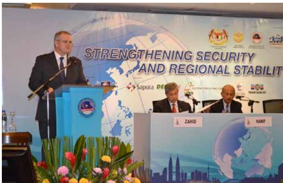
The Honourable Mr. Scott Morrison, Minister for Immigration and Border Protection, Australia as the second speaker of Session 1

Stronger regional borders, both internally and externally are needed to protect the borders in such a threat environment. He added that the concept of a regional border in line with the above, recognizes the fact that domestic borders