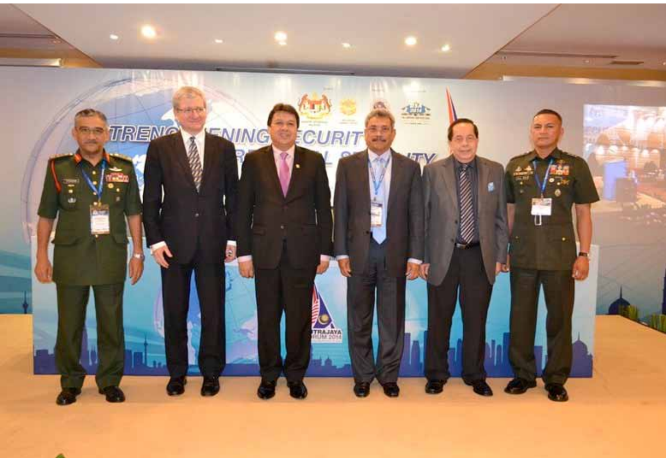
A Session 6 group photograph with distinguished moderator and speakers