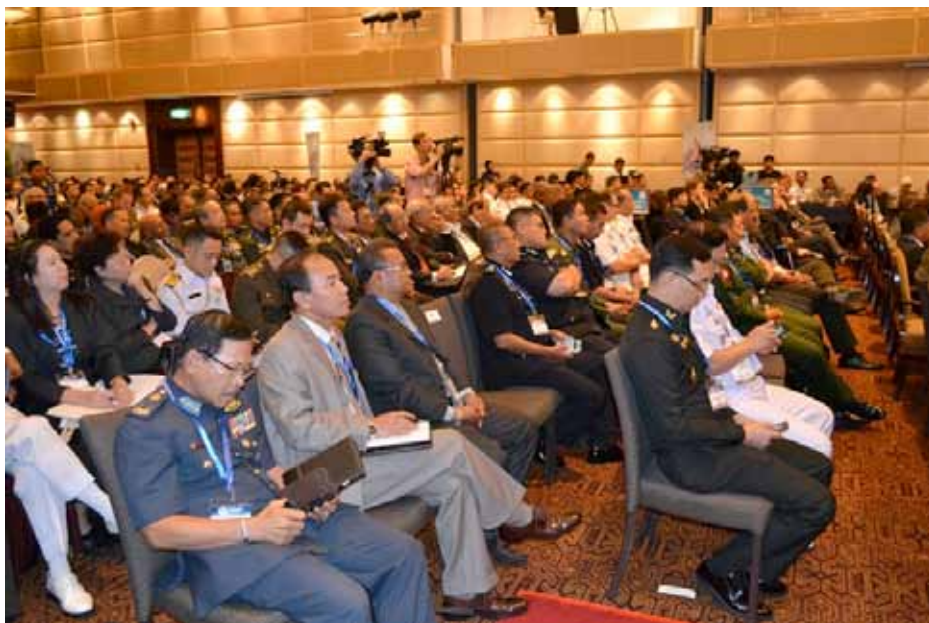
Senior Government Officials as participants of Session 1

analytical tools to collect and manipulate data in discovering trends and anomalies that may assist in the detection of malpractice at the border.