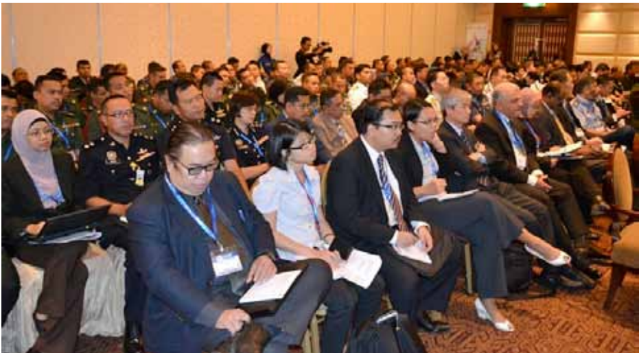
Civilian and Uniformed Participants of Session 2

accounts contained millions of dollars considering the salary of a former president of Ukraine cannot be explained. He noted that when totalitarian regimes collapse and dictators go into exile the world is quite often surprised to hear about the great amounts of money these people have transferred abroad. Most of these totalitarians are indeed criminals having stolen money during their time in office from the people of their countries.