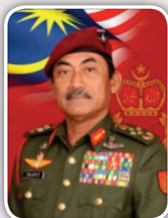
General Tan Sri Dato' Sri Zulkiple bin Haji Kassim Chief of Army