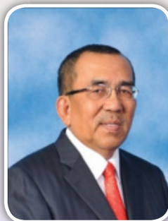
YB Dato' Sri Mohd. Johari bin Baharum Deputy Minister of Defence