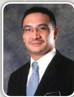
YB Dato' Seri Hishammuddin bin Tun Hussein Chairman Minister of Defence and Minister with Special Functions in The Prime Minister's Department