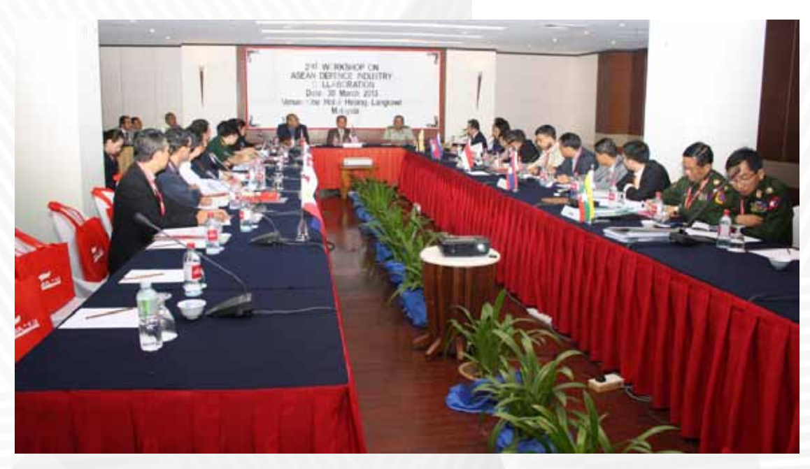
ASEAN Defence Industry Committee Workshop organised by Ministry of Defence (MINDEF) Malaysia held on Saturday 30 March 13.