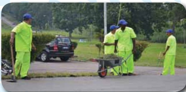
Prison inmates rehabilitation activities in army camps

MAF has offered training facilities for police basic training at Army Recruit Training Centre (PUSASDA) Port Dickson and Naval Recruit Training Centre (PULAREK) Tanjung Pengelih. Training in PULAREK began on the 18 th Jan 2011. The first batch of 498 policemen graduated on the 19 th of July 2011. The strategic collaboration between MAF and RMP witnessed a grand Passing Out Parade comprising of 3194 recruits from Army and RMP which was held on 30 th July 2011 at PUSASDA. The Prime Minister was the guest of honour for the Passing Out Parade.