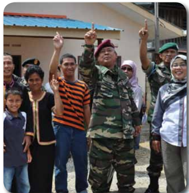
Chief of Defence Forces at the presentation ceremony of houses built by MAF

Through NBOS3, MAF and Ministry of Rural Development and Ministry of Health are working together to improve basic infrastructure in rural areas that include the building and restoration of houses and provision of water supply. MAF targeted to restore or built 887 houses before the end of year 2011. A total of 37 water supply projects were completed in July 2011 that benefited 1748 families in Sarawak. MAF was also involved in upgrading a stretch of 76 kilometres of road that connect Long Luping and Ba'kelalan.