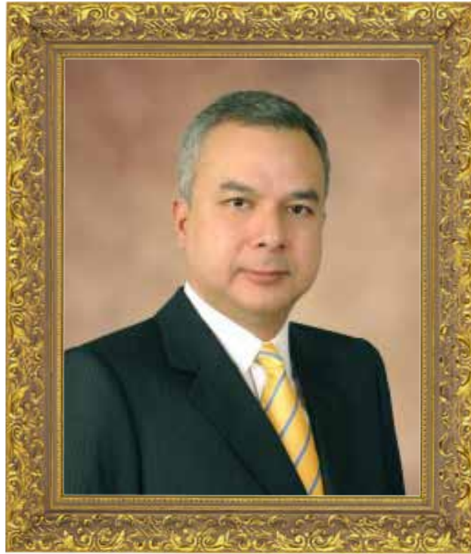
HIS ROYAL HIGHNESS RAJA MUDA PERAK DARUL RIDZUAN RAJA DR. NAZRIN SHAH IBNI SULTAN AZLAN MUHIBBUDDIN SHAH D.K., D.K.II (Selangor), D.K.S.A, S.P.C.M, S.P.T.S, S.P.M.P. (Perlis), Ph.D (Harvard)