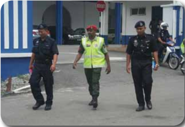
MAF and RMP personnel doing joint patrol

Another collaboration between MAF and RMP, is the crime prevention effort through joint patrol by Army and RMP personnel in high crime areas. The pilot project involved several cities such as Seremban, Port Dickson, Ipoh, Taiping, Kota Bharu, Georgetown and Kuala Lumpur International Airport. This effort had significantly contributed toward the reduction of national crime rate.