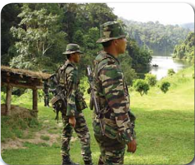
Army personnel conducting border patrol in OP WAWASAN

In another strategic collaboration, RMP has agreed to offer ex-military personnel to join the police force. The first intake involved 100 ex-military personnel. Their training began on 18 th January 2011 and completed on 14 th May 2011.