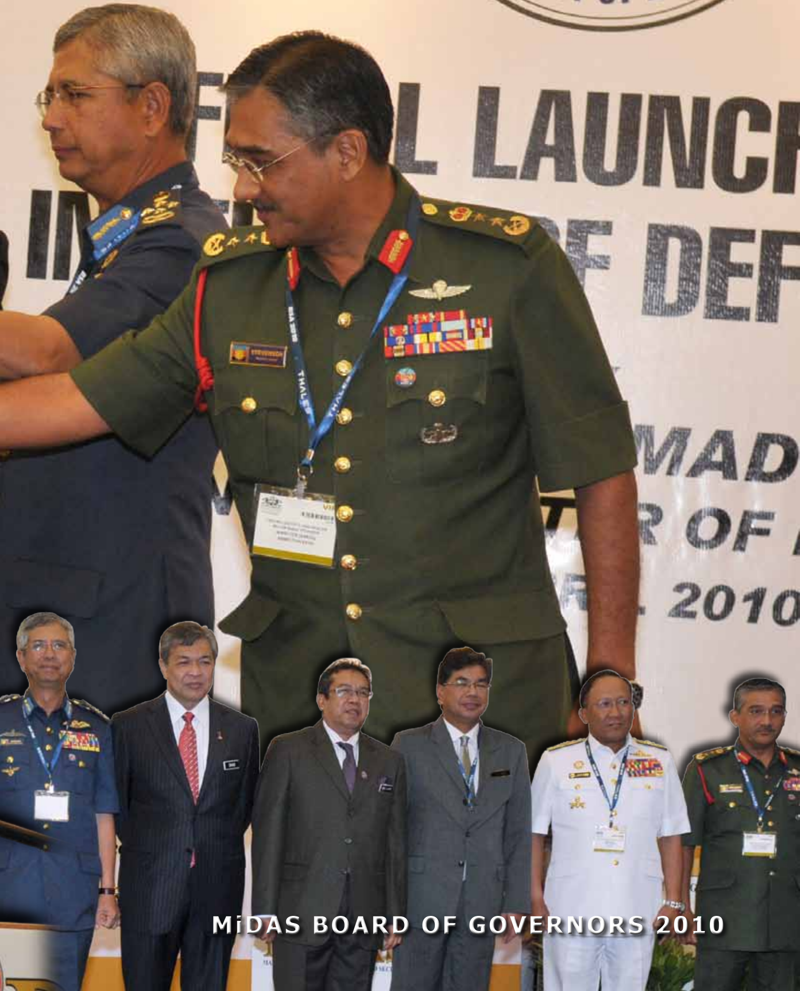
MIDAS BOARD OF GOVERNORS 2010